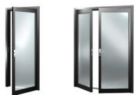
Single door French doors