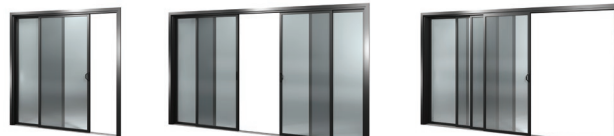
Single slider Double slider Stacking slider